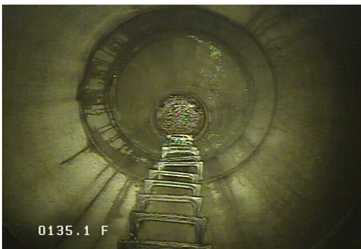
MH - Manhole @ 135.1 ft.