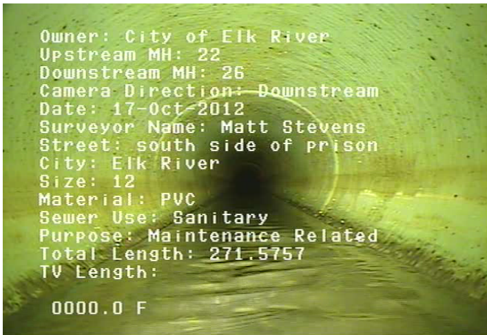
MH - Manhole @ 0.0 ft.