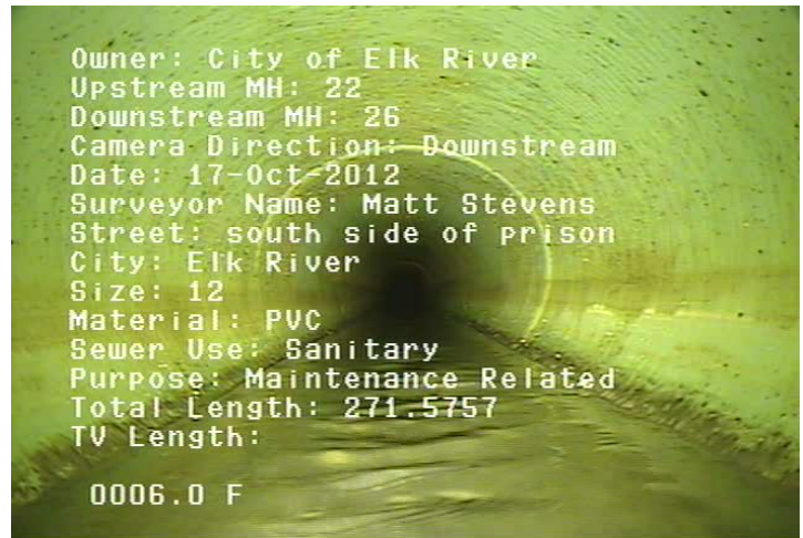
IB - Begin Inspection @ 6.0 ft.