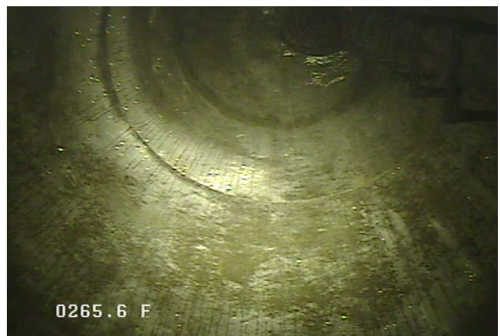
MH - Manhole @ 265.6 ft.