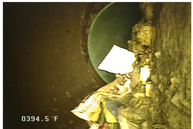
GO - General Observation @ 394.5 ft. Ramen noodle bags, condiment packs and other garbage in service