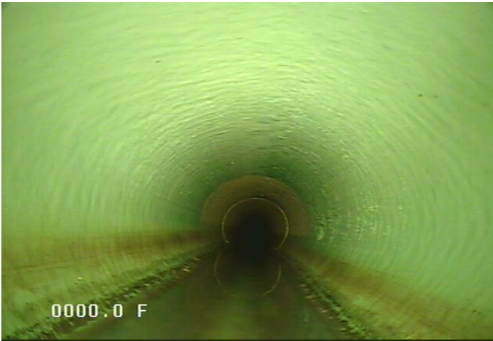
MH - Manhole @ 0.0 ft.