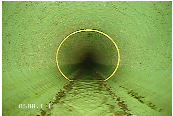
IE - End Inspection @ 508.1 ft.