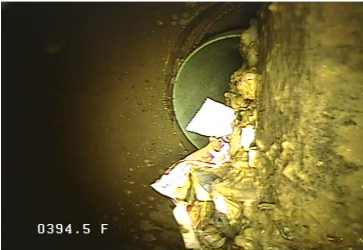
SC - Service Connection @ 394.5 ft.