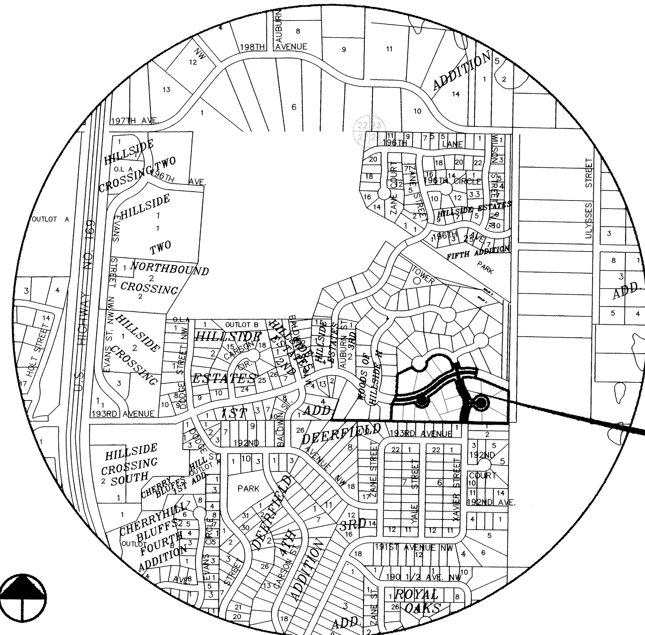
193RDTH STREET NW./VANCE AVENUE LOCATION MAP