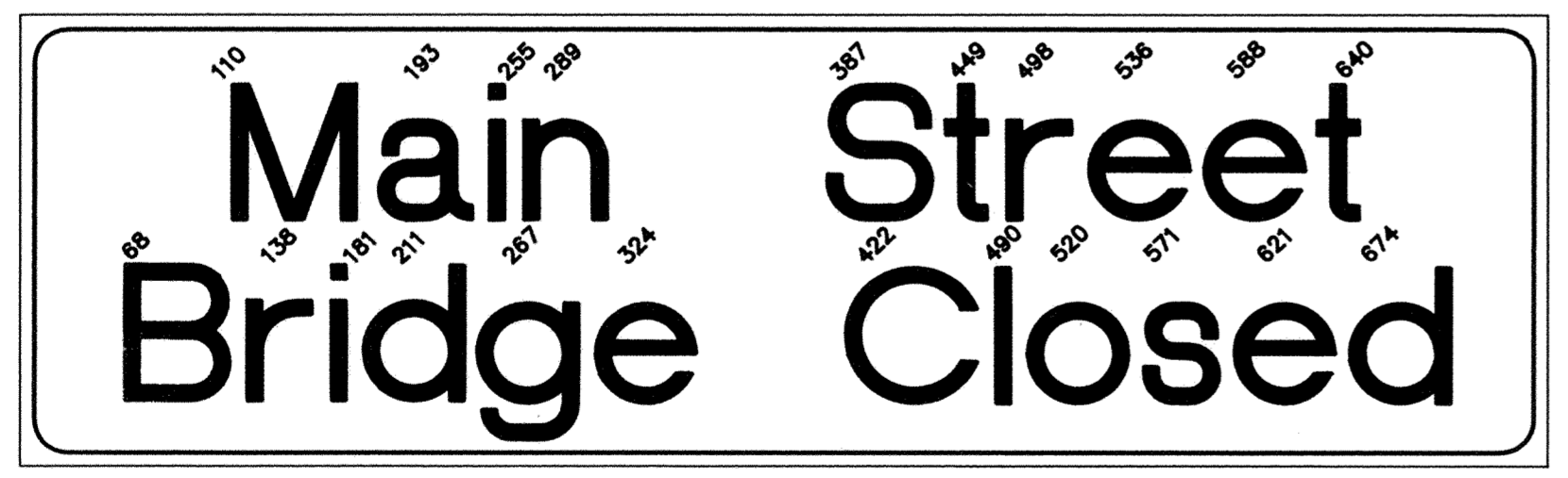
78"x30", 3"R. 1.0"B BLACK/ORANGE D-1 LINE 1 56.0 : 6"-4 1/2" E MOD. LINE 2 64.4 : 6"-4 1/2" E MOD.

TYPE III BARRICADES WITH TYPE "A" WARNING LIGHTS ACROSS ENTIRE WIDTH OF ROAD.